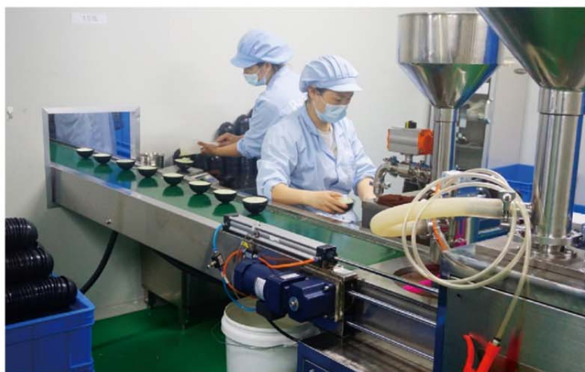
Patented Equipment 2