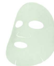
TYPE B MASK