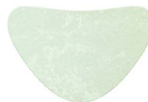
MASK FOR CHEST