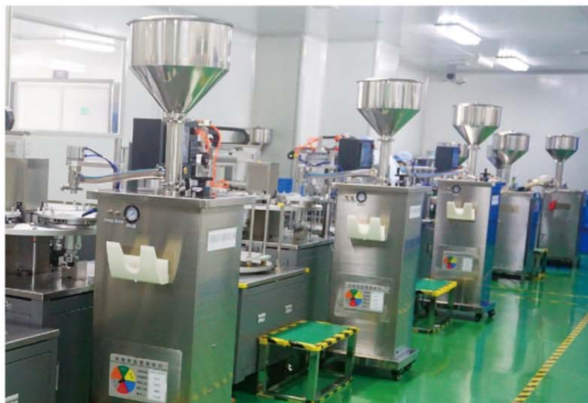
Patented Equipment 1