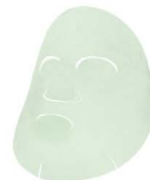
TYPE A MASK