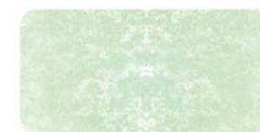
MASK FOR NECK