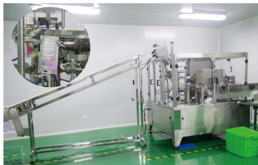
Patented Equipment 3